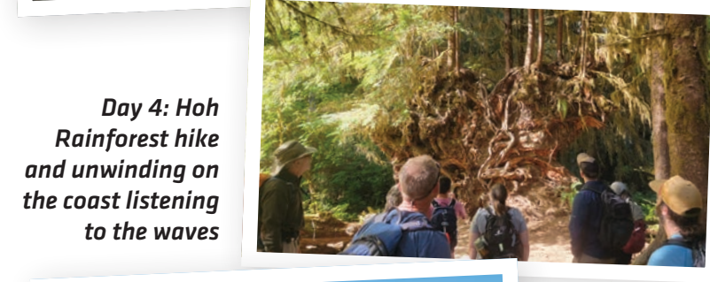
Day 4: Hoh Rainforest hike and unwinding on the coast listening to the waves