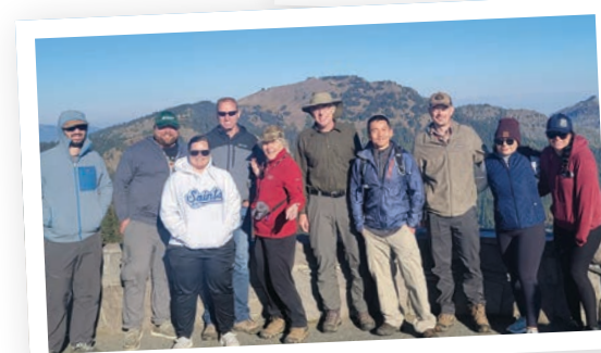
Day 5: Hurricane Ridge, Olympic National Park - Home