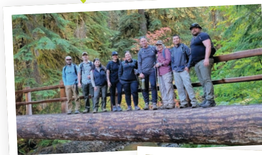
Day 3: Six-mile hike through the old growth forest ends at natural hot springs