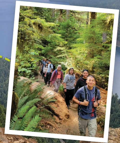
Day 1: Seattle to Olympic National Park - Lake Crescent

Wilderness Inquiry + Olympic National Park The DAV of Minnesota Foundation gave a grant to eight Minnesota Veterans to travel through Olympic National Park. This group bonded quickly, getting time to rest, take in new sights, push their limits, and connect with the outdoors.